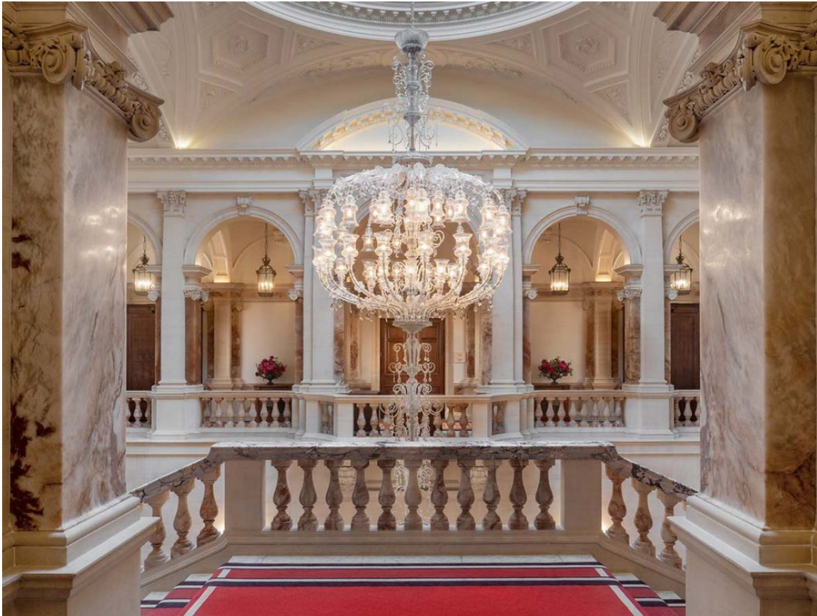
Meridies chandelier by iDOGI at the Old War Office, London

In the beginning, it was the “ Old War Office ,” a prestigious building in Whitehall , seat of the imperial military machine of Great Britain, from which Churchill directed the operations of World War II. A historic building that takes on a new life today: it was sold by the Ministry of Defence, and has become a luxury hotel: Raffles London at the Old War Office . After major refurbishing, the OWO officially opens its doors on 29 September, with 120 rooms and 85 spacious private residences, nine restaurants, three bars, a spa and a fitness facility.