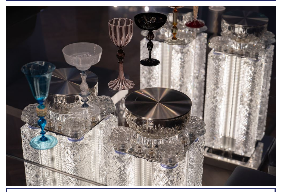
For iDogi, inspiration comes from Venice and its historical, artistic and architectural suggestions.

iDOGI is a company founded in 1968, based in Venice, renowned for the 'bespoke' creation of majestic chandeliers, sculptures and furnishings in Venetian artistic glass for some of the most exclusive palaces and residences in the world. Its light collections include extraordinary pieces of design, tables, balustrades and crystal fountains. All creations are custom-designed by a team of expert designers from the company's Style Office and handcrafted by the best glass masters to meet the expectations of the most prestigious customers.