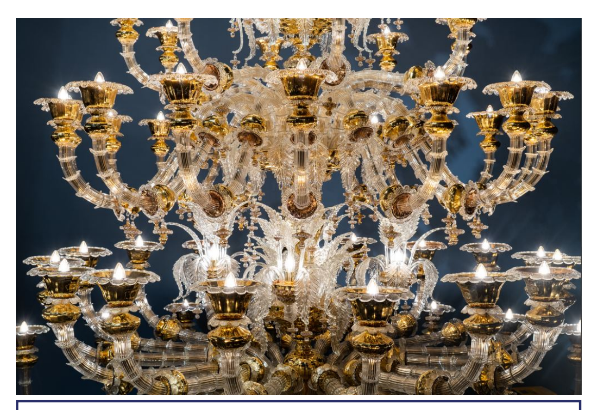
The iDogi company based in Venice specializes in the design and manufacture of luxury chandeliers in Venetian artistic glass. In addition to the "oversized" chandeliers, the company designs light tables, light balustrades and crystal fountains.